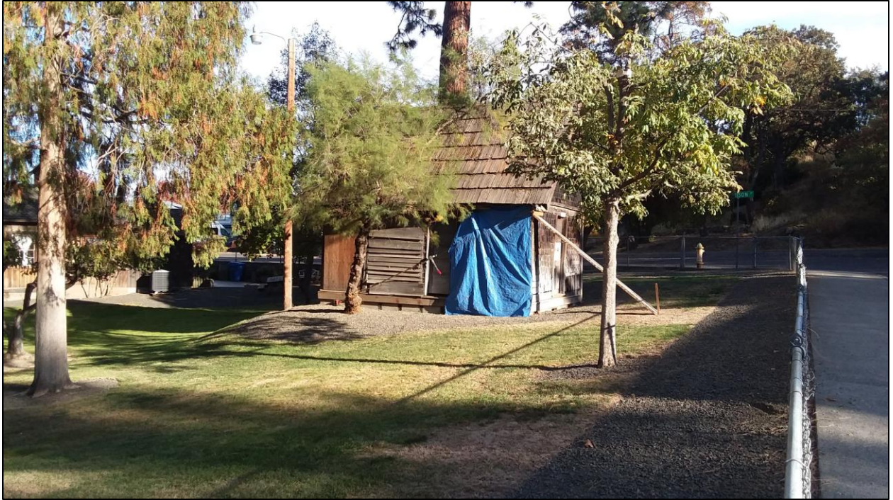
FIGURE 3. ADDITIONAL BRACING IN PLACE.