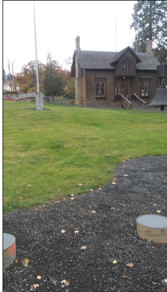
FIGURE 4. GUARDHOUSE BAR MOUNTING LOCATIONS WITH VIEWS TOWARDS THE BELL POST AND THE SURGEON'S QUARTERS.