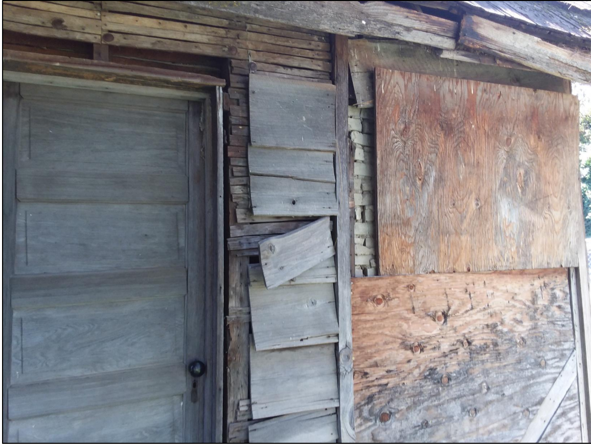
FIGURE 1. SW CORNER BEFORE STARTING WORK.