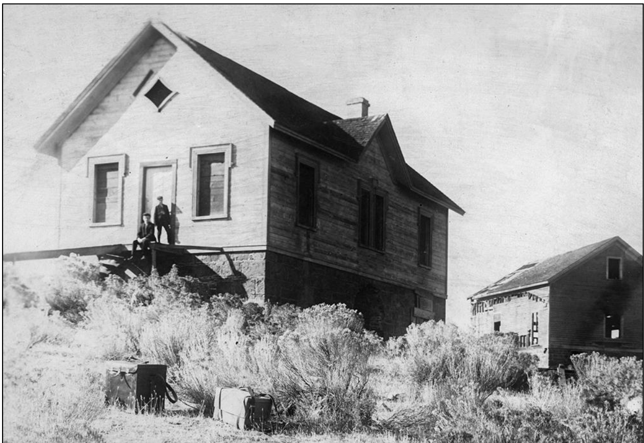
FIGURE 1. ABANDONED GUARDHOUSE