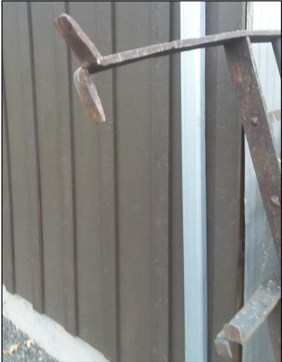
FIGURE 3. MOUNTING PROJECTIONS FROM THE GUARDHOUSE BARS. LEFT IMAGES SHOWS THE STAMP.