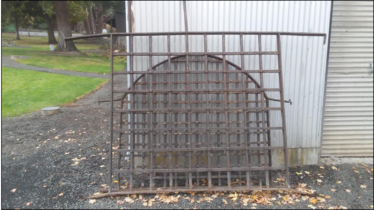
FIGURE 2. GUARDHOUSE BARS LEANING AGAINST THE VEHICLE BUILDING.