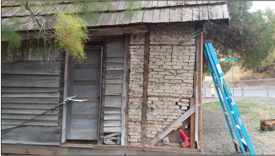
FIGURE 2. PULLING COME ALONG AND BRACKETS AND JACK IN PLACE AT THE END OF THE FIRST DAY OF STRAIGHTENING.